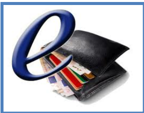
What's in your e-Wallet?

The NC Securities Division has issued an investor advisory (see pages 2-3) cautioning investors to consider the risks associated with virtual currencies.