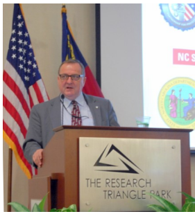
SOSNC Chief Deputy Maddox Addressing Cybersecurity Conference